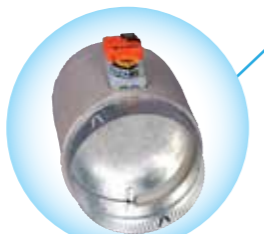
Belimo Motorised Damper