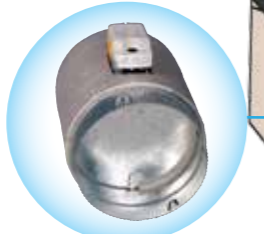
Siemens Motorised Damper