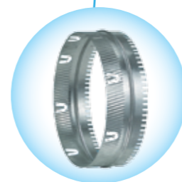
Castellated Collar with "V" - Clamping System