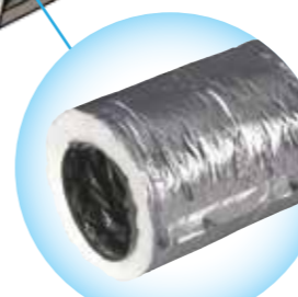
Performance / BCA Standard Flex Duct