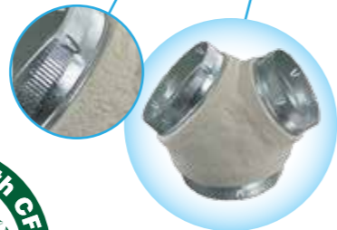
Superior Flow Patented Insulated Collar "Y" with "V" - Clamping System