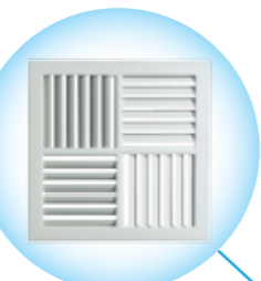
Supply Air Outlet

Up To 65°C Roof Cavity Temperature In Summer